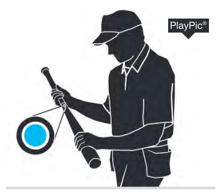
Updated NCAA rule language for the 2023 season clarifies that a bat without the proper bat testing sticker is an illegal bat.

The first sentence of the penalty now reads: "A bat without the proper bat testing sticker, that has been altered to improve performance, or that has