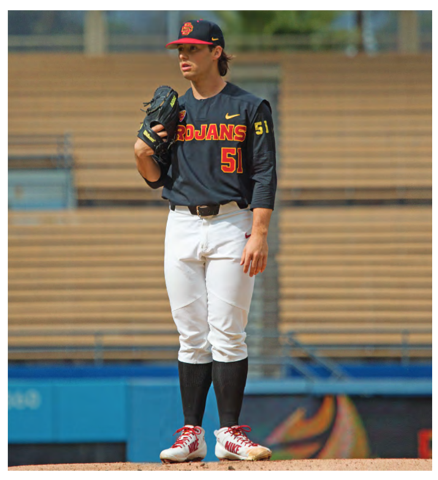
The NCAA has once again made changes to the 20-second action clock for the 2023 season. A pitcher now must begin their windup motion or motion to deliver the pitch, or make a legitimate pickoff attempt, within the 20-second window.

With runners on base, the pitcher may attempt as many pickoff throws as desired, which will stop the action clock and reset it when the ball is