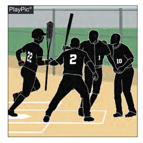
The use of celebratory props on the playing field is not allowed due to a 2023 NCAA rule change. They are still allowed in a team's dugout. The first offense is a warning, and a second occurrence requires the ejection of the offending personnel.

Finally, America's pastime has a long and storied history, and every part